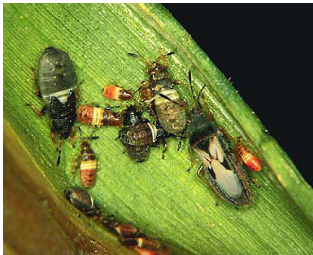
Figure 1. Chinch bug life stages.

The chinch bug is a native North American insect that can destroy cultivated grass crops, especially sorghum and corn, and occasionally small grains, such as wheat and barley. Broad-leaved plants are immune to feeding damage. Crop damage from this insect is most often found in southeast Nebraska and northeast Kansas and is associated with dry weather, especially in the spring and early summer months. Chinch bugs have few effective natural enemies. Ladybird beetles and other common insect predators found in Nebraska prefer to feed on other insects rather than on chinch bugs. Although chinch bugs can be difficult to control, many farmers have satisfactorily protected their crops with an integrated program of careful crop management and insecticide application.