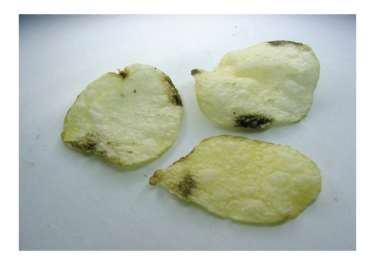
Figure 6. Internal Blackspot as seen on a potato chip.

tifying IBS and pressure bruising is caused by melanin, a pigment formed in the phenolic reaction. (Note: This is the same pigment that darkens human skin). As with pressure bruising, susceptibility to IBS is related to tuber dehydration or firmness. Tuber firmness may be inversely related to the amount of dry matter in the tuber, thereby making tubers with higher solids more susceptible to IBS than those with lower solids. Tubers should be harvested when their internal temperature is above 45° F and less than 65° F. Also, harvesting when the soil is moist helps minimize the occurrence of damage.