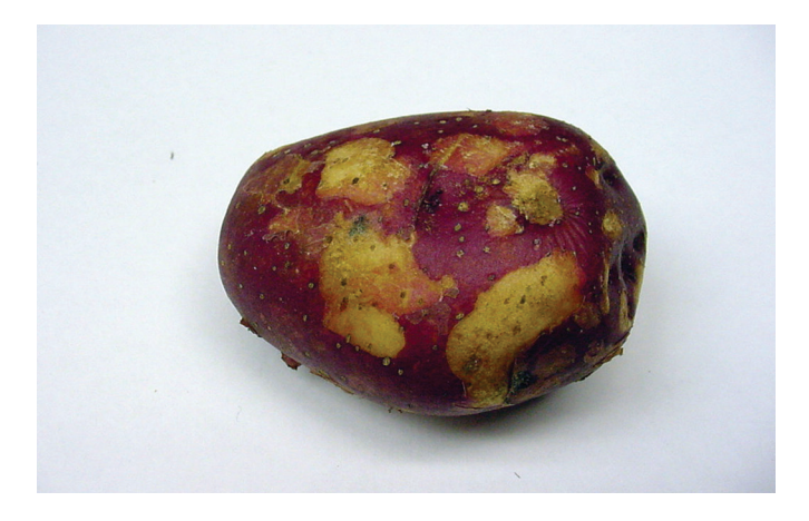
Figure 2. Skinning of tuber skin.