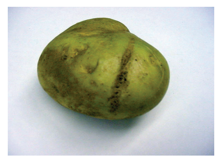
Figure 1. Slice or cut through tuber skin.

A very common type of bruising is skinning, which involves a tearing of the periderm resulting from impacts with blunt objects or the sides of harvest and piling equipment ( Figure 2 ). Skinned areas turn dark after a short time, making tuber appearance unacceptable, and as mentioned