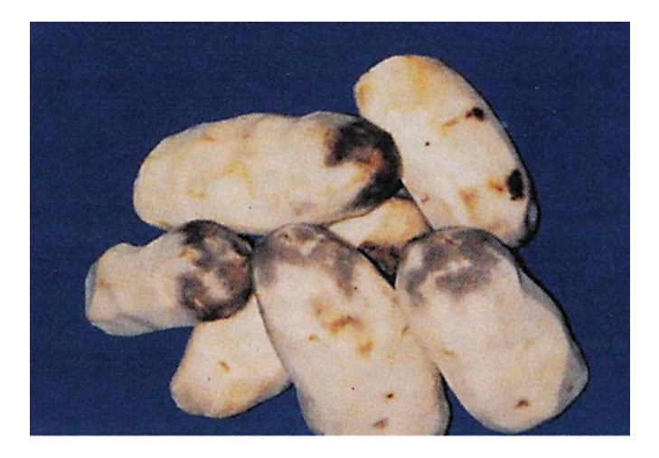
Figure 7. Tetrazolium test, Ranger Russet after peeling.

Purple or dark red areas indicate bruises. The severity is estimated by the number of strokes it takes a potato peeler to get below the discoloration. One stroke indicates a surface bruise, probably skinning or slight shatter. Two strokes indicate a shallow bruise, shatter, deep abrasion, or slight cut. If more than two strokes are needed to remove the catechol stain, the bruise is deep and serious.