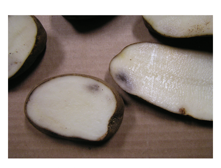
Figure 5. Internal Blackspot (IBS) below tuber skin.

IBS forms as a result of an impact of the tuber against a hard surface such as the sides of the harvester or piler. The discoloration under the skin appears one to two days after the impact. As with pressure bruising, it results from a phenolic reaction in the wounded cells. Cells collapse; ethylene is released; and further cell wall breakdown occurs, resulting in more cell death. The dark discoloration iden-