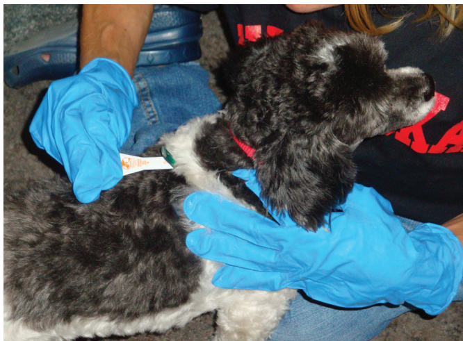
Figure 3. Applying spot-on treatment to a small dog.

reduces irritation caused from pest bites and the diseases transmitted by them. Pet owners must use these products according to label directions or as directed by a veterinarian. The spot-on treatments may be used for several months (follow a vet's recommendation) during times when fleas or ticks are known to be active in the pet's locale.