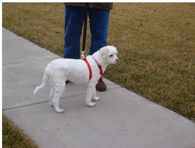
Figure 2. Keep pets off the yard after applying pesticides; wait for pesticides to dry or be integrated into the soil before allowing access.

To control pests like cockroaches indoors, use crack and crevice treatments, such as gel baits or dust treatments, to reduce the risk of exposure to pets. In general, these are less toxic products and are formulated for use in areas where pests hide but that people and animals can't access. Household cleaners designed to kill microbes are consid-