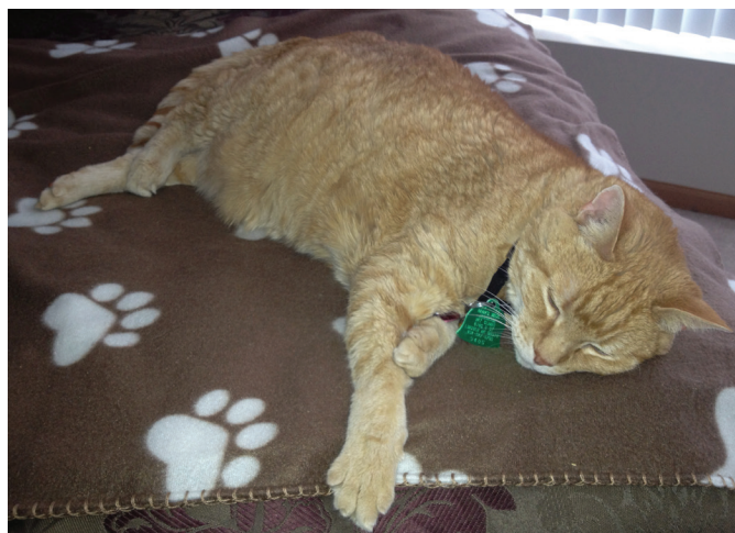
Figure 1. Pets are an integral part of our lives; protect them from pests and pesticide poisoning.

Pets are an integral part of our lives (Figure 1), and historically, pets have been recorded as living with humans for thousands of years. The American Veterinary Medical Association estimates there are over 76 million dogs and