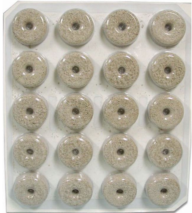
Figure 5. Mosquito briquets slowly release Bti or methoprene for larval mosquito control and are effective for 30 days.

A formulation of Bacillus sphaericus (Vectoless CG™) can be used in water with high levels of organic matter such as stagnant sewage lagoons.