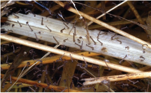
Figure 3. Mosquito wrigglers.