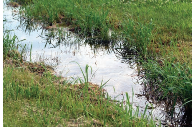
Figure 4. Potential mosquito breeding site.

Eliminate Breeding Sites. Mosquito breeding sites in urban and residential areas include children's wading pools, rain barrels, birdbaths, flower pot bases, clogged gutters, pails, and discarded tin cans — anything that can trap and hold water. Additional sites for acreages and country settings (Figure 4) include ponds, ditches, sewage lagoons, and used tires. Because mosquitoes breed quickly in the summertime, standing water should be drained weekly. Rinse and clean birdbaths on a weekly basis and cover wading pools.