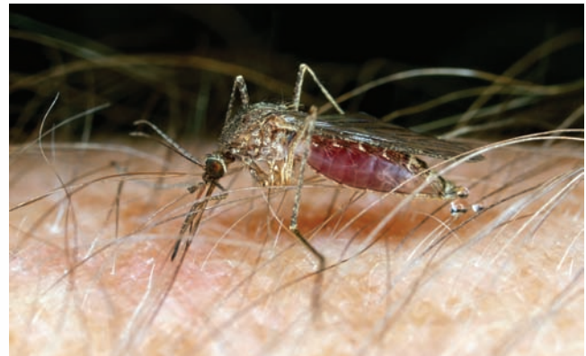
Figure 1. Adult mosquito following blood meal.

Mosquito larvae, also called “wrigglers” ( Figure 3 ), survive best in still water, where they can come to the surface and