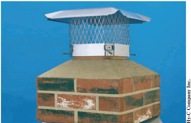
Figure 5. Stainless steel chimney excluder.

To reduce future problems with squirrels in buildings, prevent their access by inspecting and repairing small holes before they become large enough for squirrels to enter. Never secure an opening unless certain that it is no longer being used. Prevent air movement by filling gaps with caulk or expanding foam before covering openings with metal flashing, ¼-inch weave hail screen, or other permanent material. From the outside of the building, secure air-vents with ¼-inch hardware cloth. Paint the mesh to match the color of the vent to reduce its visibility. Secure roof vents with professionally manufactured stainless-steel screens. Consult with a roofer on proper installation techniques to prevent leaks. After ensuring that chimney flues are functioning properly, install a professionally manufactured stainless-steel chimney cap ( Figure 5 ).