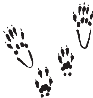
Figure 4. Tree squirrels typically hop, placing their hind feet forward of their front feet.

Squirrels can squeeze through holes 1.5 inches in diameter and will enlarge smaller holes by gnawing. Squirrels can climb vertical brick or masonry walls that have a roughened surface. They can enter through vents, chimneys, broken windows, knotholes, and gaps in construction under eaves or