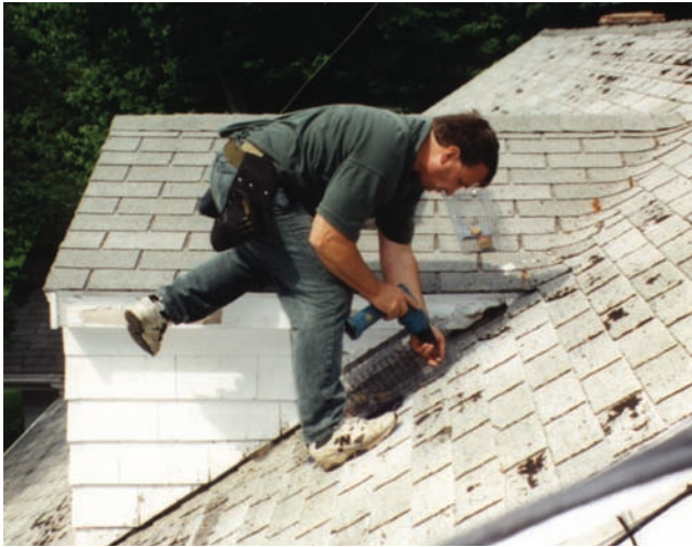
Figure 7. A professional placing a squirrel cage trap on a roof.

and May to reduce the risk of orphaning young. Translocation of squirrels is illegal in Nebraska. A problem squirrel must be released within 100 yards of capture site or euthanized. Euthanasia information may be found at icwdm.org .