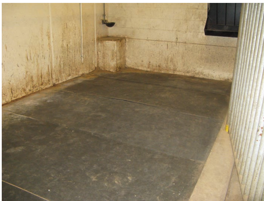
Figure 2. Rubber stall mats are an easy-to-clean, soft stall for horses.