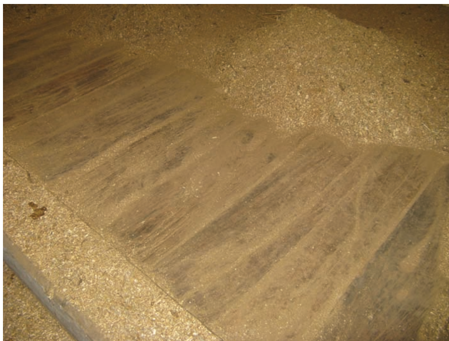
Figure 1. Minimum maintenance is required on a wood plank floor.

Rubber stall mats are expensive, but can provide an easy-to-clean, soft stall for horses. When installing rubber mats the floor should be level and well-packed. Ideally, mats should be one piece or a minimal number of pieces and at least 5/8 inch thick. Mats should fit tightly to each other and to the stall walls ( Figure 2 ). The mats must be durable enough to withstand pawing. Bedding should be used in conjunction with mats to absorb urine. Mats can be placed over nearly any type of flooring, provided it is level.