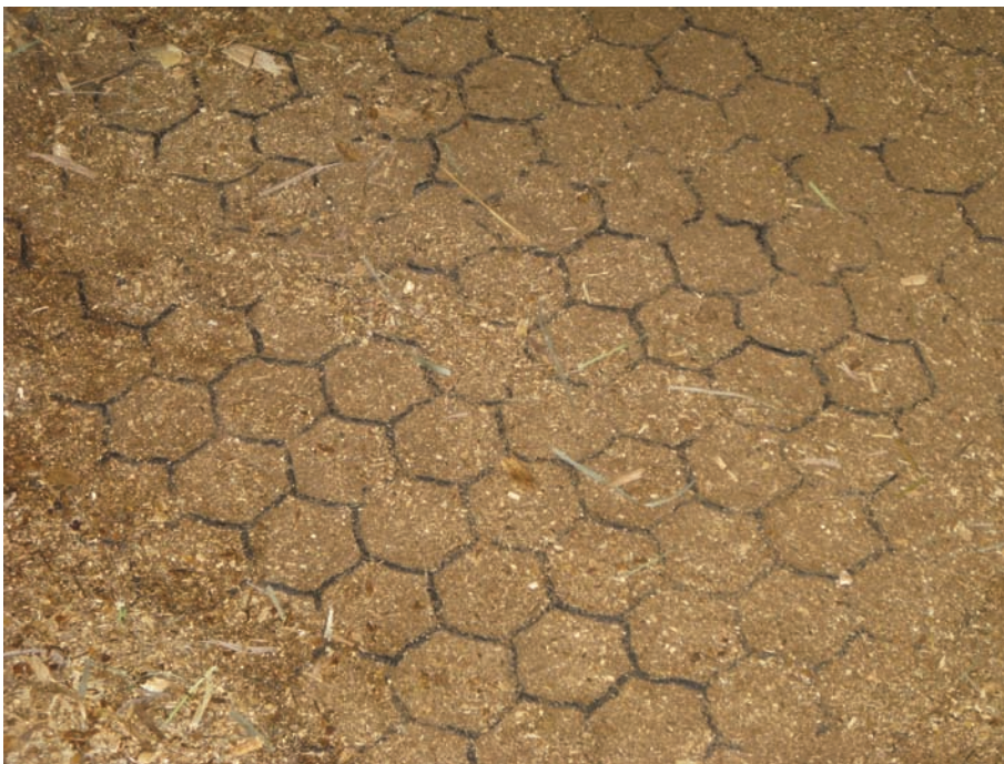
Figure 4. Installed honeycomb-shaped flooring.