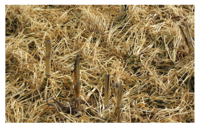
Figure 6. Oats-brassica mix in a corn silage field in early December after several freeze- thaw cycles during November. Although the forage is flat (less than 3 inches tall) and yellow, 1.5 tons/ ac of high-quality forage remain in this field.