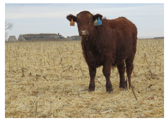
Figure 4. Calf grazing an oats-brassica mix near Clay Center, Neb., in January. Calves grazing on oats-brassica mixes in the fall have gained between 1.5 and 2.0 lb/d.

Although rare, cattle have been known to choke on turnip bulbs of purple top turnips. In spite of the potential risks associated with grazing forage brassicas and small grain forages, this combination has potential for substantial beef production. Mixtures containing brassicas (turnips and radishes) and oats have produced from 1 to 3 tons DM/ac when planted in August and September. When stocked at a rate of one 600 lb calf/ ton of DM and grazed for 50 to 60 days beginning in early November, calves ( Figure 4 ) have gained 1.5 to 2 lb/hd/d and resulted in beef production from 100 to 150 lb of gain/ac.