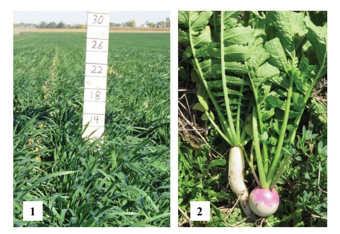
Figure 1. Oats in early November after being planted in early September following corn silage harvest.

Producers have successfully used forage double-crops in hybrid seed corn production for many years. Commonly, a brassica and/or small grain forage is planted in late July or early August when the male rows are removed. Grazing can begin soon after the hybrid seed is harvested in late August or early September. However, delaying grazing to later in the fall will increase forage yield.