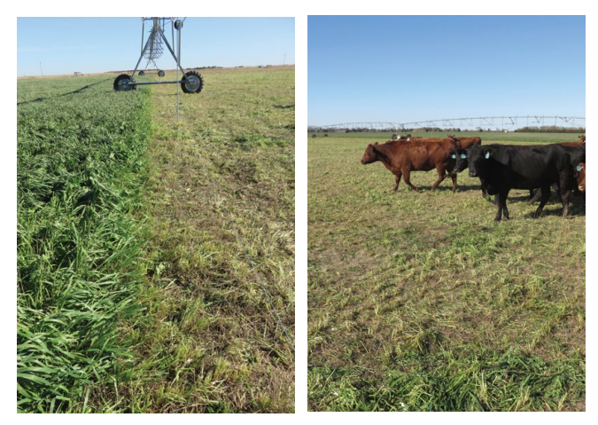
Figure 5. A pivot fence used to control grazing of an oats-brassica mix. Giving daily allocations can significantly improve grazing efficiency. Given the high nutrient content of cool-season annuals, this is an option that will allow limit feeding of dry cows and extend the grazing season.