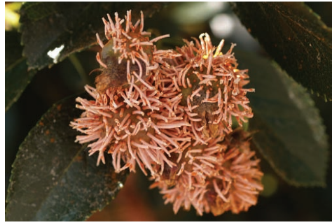
Figure 2. Cedar-Hawthorn rust producing aecia on hawthorn fruit.

Although infection sites are superficial, their presence may reduce fruit quality by causing a decrease in size, distortion or premature abortion from the tree.