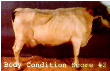
Body Condition Score 2

Loin Area: Ends of short ribs sharp to touch. Upper surfaces can be felt easily. Deep depression in loin. Cows after having a severe DA are typically scored a 1.