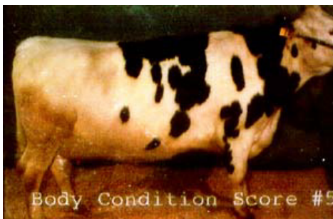
Body Condition Score 5

Loin Area: Short ribs cannot be felt even with firm pressure. No depression is visible in loin between backbone and hip bone.