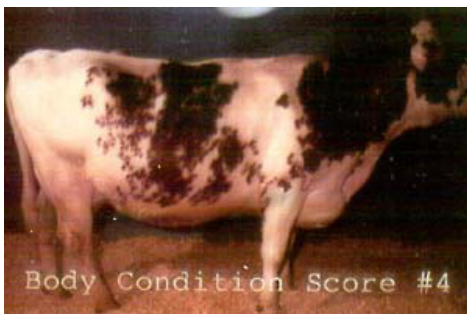
Body Condition Score 4

Loin Area: Ends of short ribs can be felt with pressure. There is a thick layer of tissue on top. There is only a slight depression in the loin.