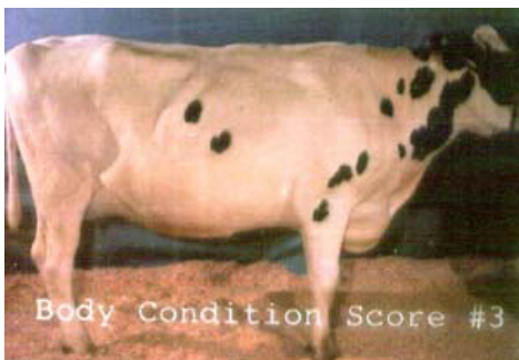
Body Condition Score 3

Loin Area: Ends of short ribs feel rounded. Upper surface felt with slight pressure. Depression visible in loin. High-producing, early lactation cows should score 2.