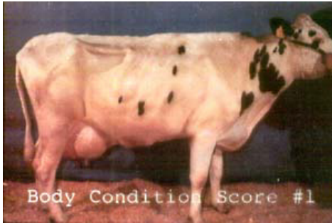
Body Condition Score 1