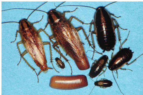
Figure 1. German cockroach.

Four species of cockroaches live in Nebraska homes: the German cockroach ( Blattella germanica , Figure 1), oriental cockroach ( Blatta orientalis , Figure 2), brown-banded cockroach ( Supella longipalpa , Figure 3) and American cockroach ( Periplaneta americana , Figure 4). The two most common types in Nebraska are the German cockroach and the oriental cockroach. German cockroaches are usually found in kitchens and bathrooms. Oriental cockroaches often are found in the basement because they like cool, moist environments and are sometimes called "waterbugs."