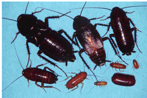
Figure 2. Oriental cockroach.