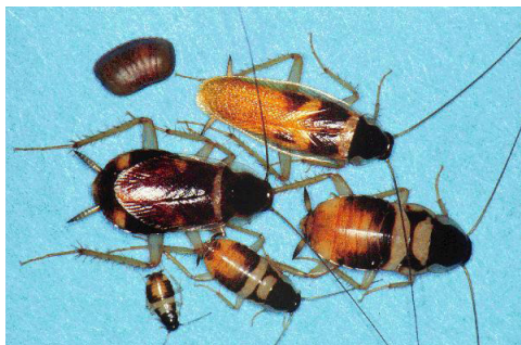
Figure 3. Brownbanded cockroach.